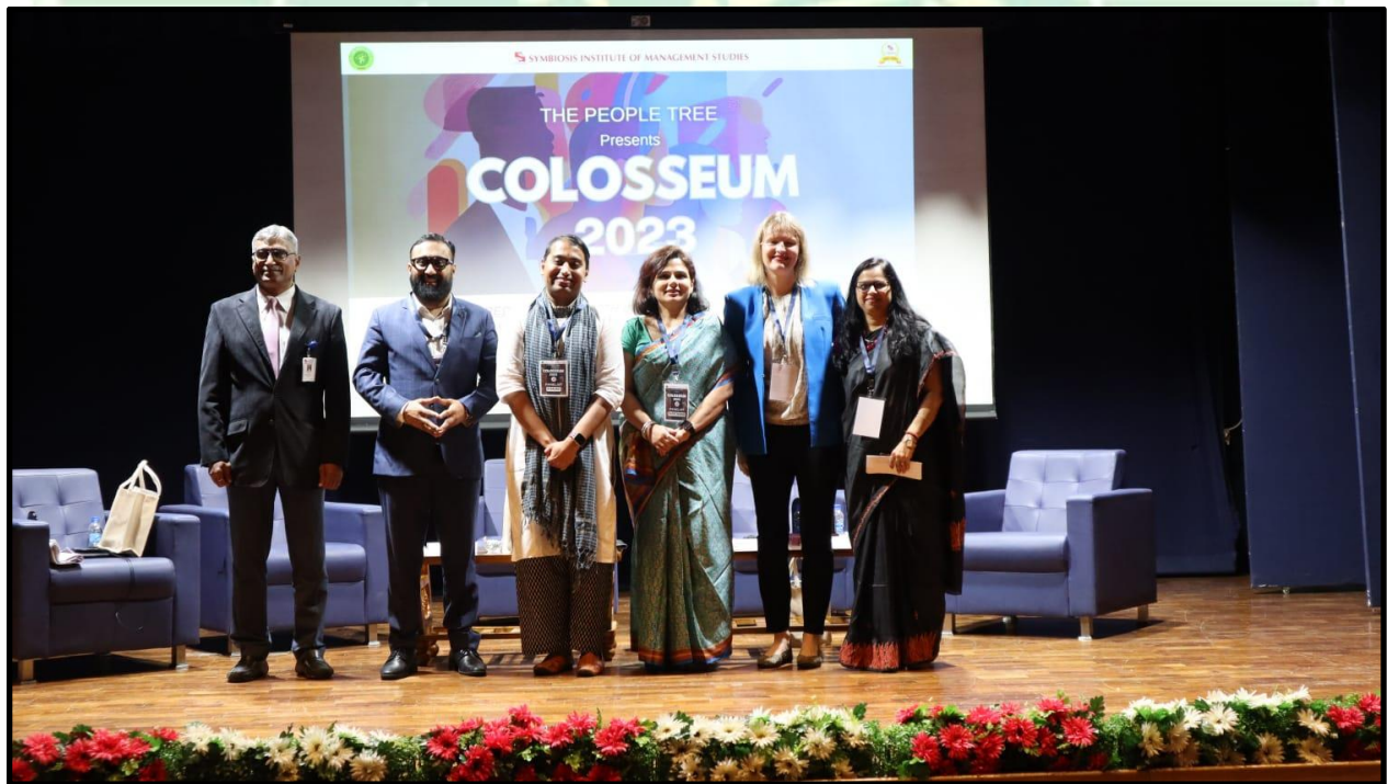
Guest Session - "How to Crack Sip Interviews"