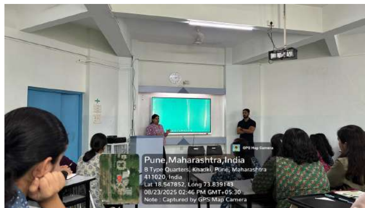
Fig. 19: SIP Preparation Session

The SIP Preparation Session was organized for the first year Finance specialization student managers to ready them for the upcoming summer internship season. Held on August 23, 2025, the event featured two guest speakers from the finance sector. The session's primary goal was to provide an overview of the SIP placement process for freshers . The guests offered insights into the expected interview questions for both experienced and non-experienced candidates from diverse academic backgrounds (Commerce, Engineering, etc.). The session concluded with an interactive Q&A segment, allowing students to address their specific queries regarding finance internship preparedness. A total of 71 students attended the session.