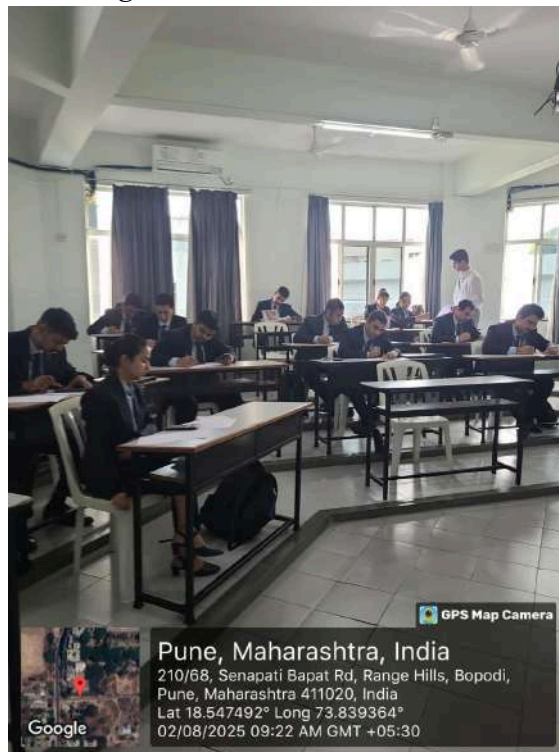
Fig. 16: Mock GD-PI Sessions