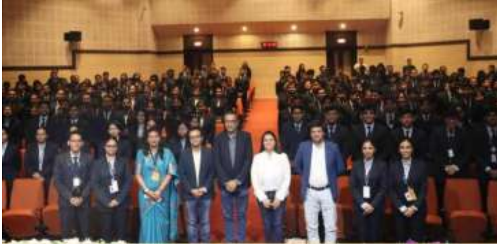
Fig. 2: Stratagem 2024