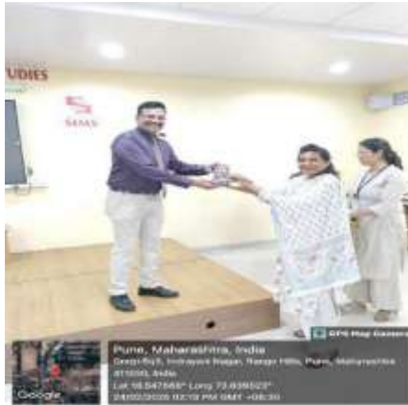
Fig. 13: Derivatives workshop

The session equipped participants with essential skills for careers in derivatives trading, financial consulting, and risk management.