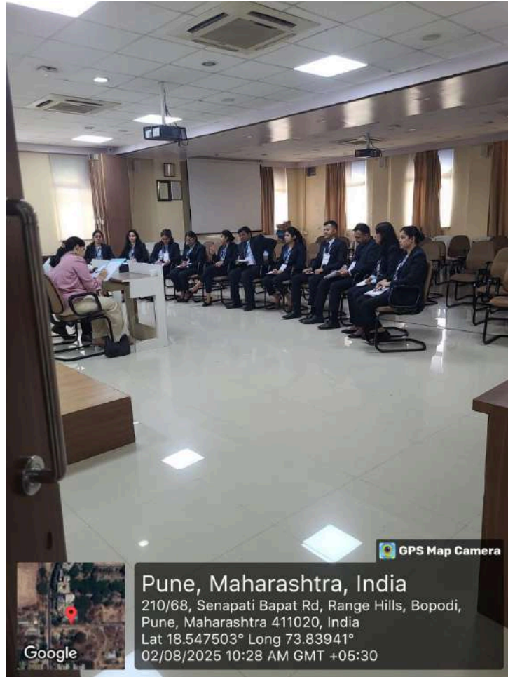
Fig. 17: Mock GD-PI Sessions