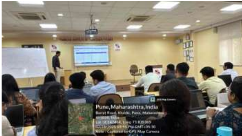
Fig. 14: Derivatives Workshop