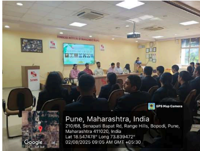
Fig. 15: Mock GD-PI Sessions

The process consisted of three components: Aptitude Test, Group Discussion (GD), and Personal Interview (PI) . The 90-minute Mock Aptitude Test assessed logical, quantitative, behavioral, and basic finance technical knowledge. The two-day GD round of each session involved 96 students discussing both abstract and finance-specific topics, judged on communication and teamwork. Finally, the two-day PI session focused on assessing domain expertise, career clarity, and technical knowledge through resume-based and scenario-handling questions. External guests were invited as panelists to provide real-time feedback and evaluation on student performance.