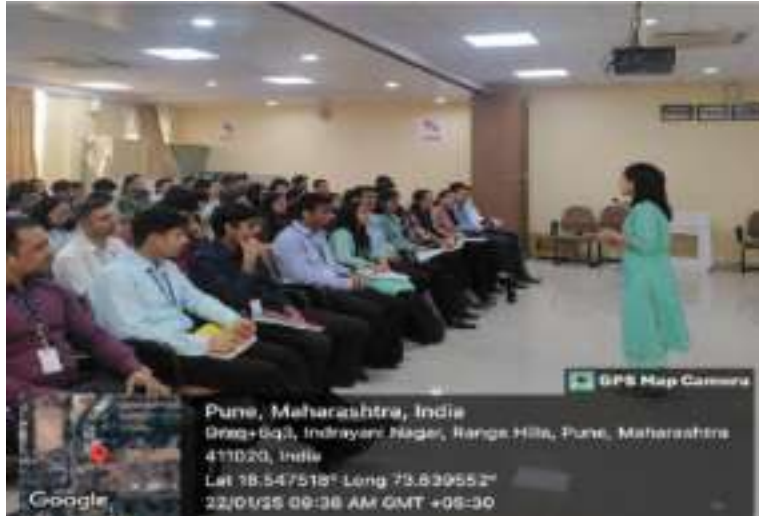
Fig. 10: Credit Rating and Bond Market Analysis Workshop