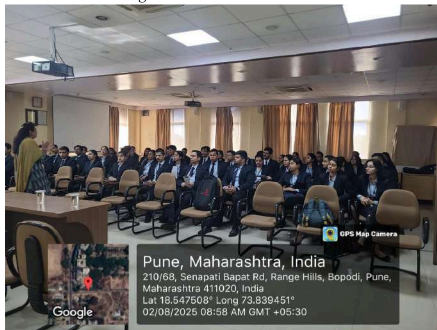
Fig. 18: Mock GD-PI Sessions