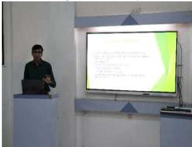
Fig. 4: Financial Frenzy