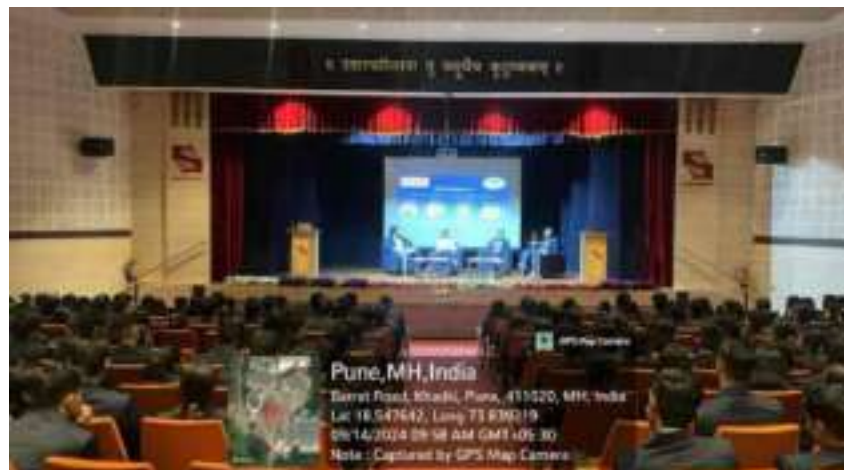
Fig. 1: Stratagem 2024

The event was highly beneficial for professionals aiming to enhance their competitiveness in the BFSI industry.