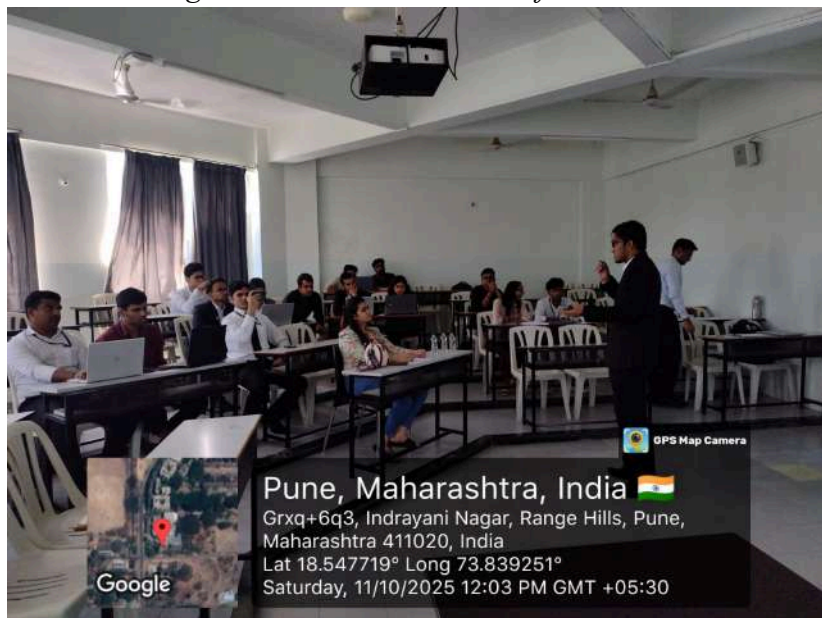
Fig. 24: Presentation round of FinArena