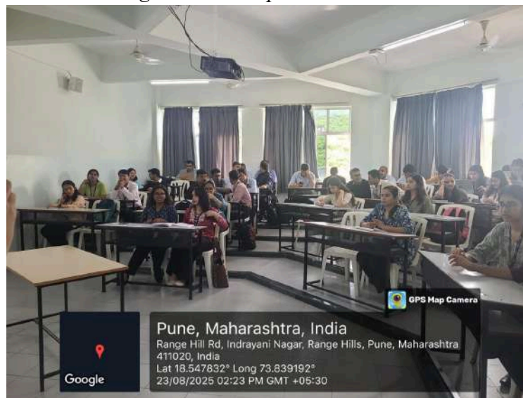
Fig. 20: SIP Preparation Session