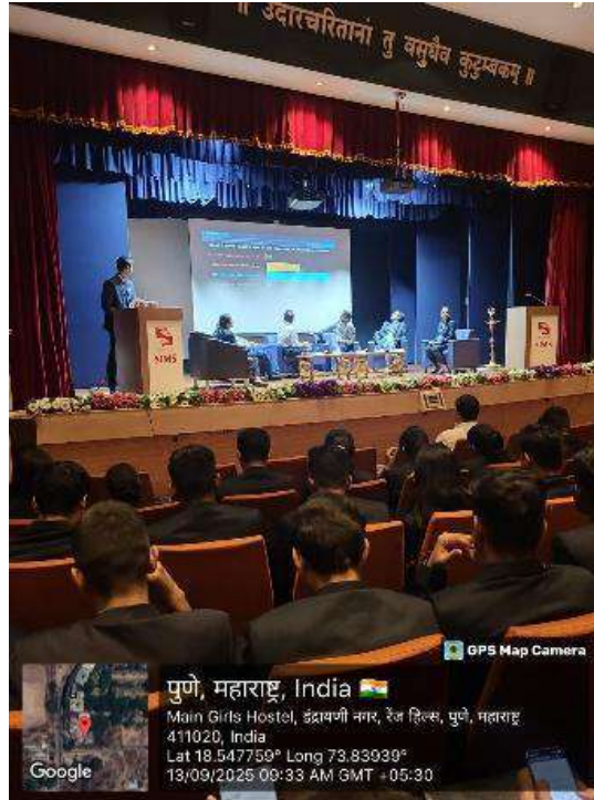
Fig. 22: Stratagem 2025