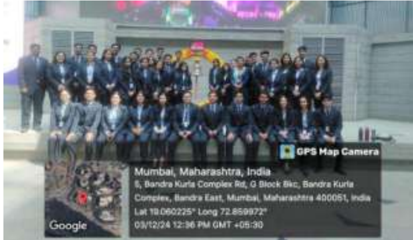
Fig. 5: Study tour to NSE and NISM

The visit bridged academic knowledge with real-world industry practices, equipping students with valuable market expertise.