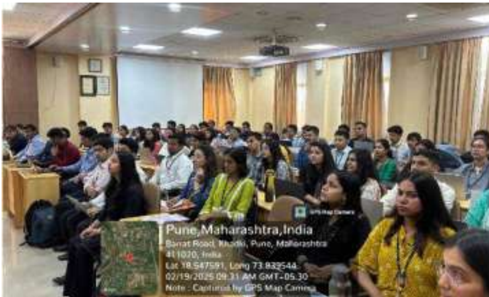
Fig. 12: Role of RBI in Financial Stability Workshop