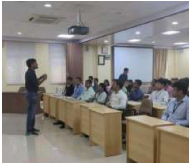
Fig. 7: Corporate Valuation Guest Session

The session provided participants with industry-relevant knowledge essential for careers in corporate finance, investment analysis, and valuation consulting.