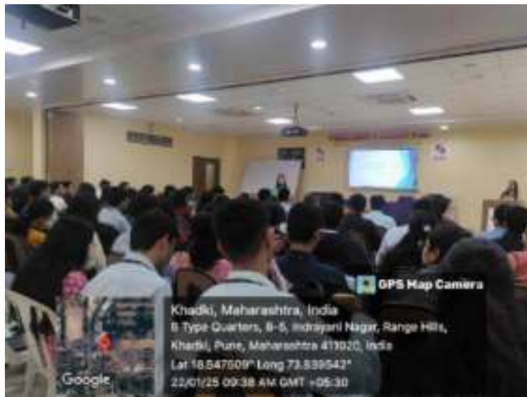
Fig. 9: Credit Rating and Bond Market Analysis Workshop

Participants gained practical knowledge essential for careers in finance, banking, and investment analysis.