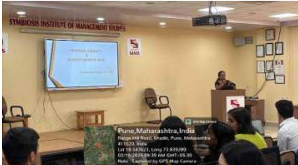
Fig. 11: Role of RBI in Financial Stability Workshop