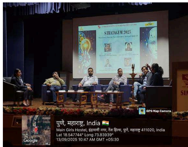
Fig. 21: Stratagem 2025

The event was highly beneficial for professionals to get aware of the latest changes induced and created by Artificial Intelligence in the finance sector.