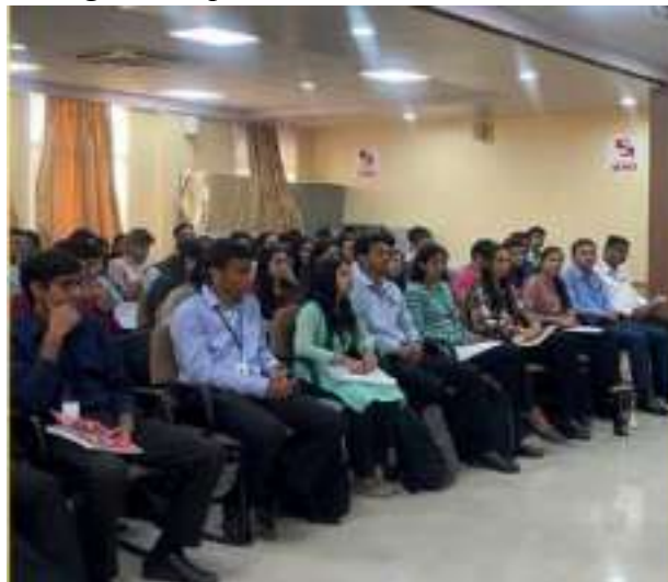
Fig. 8: Corporate Valuation Guest Session

Theme: Workshop on Credit Rating and Bond Market Analysis