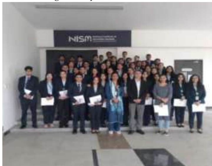
Fig. 6: Study tour to NSE and NISM