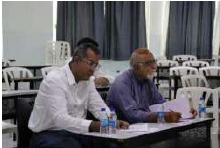
Fig. 3: Financial Frenzy